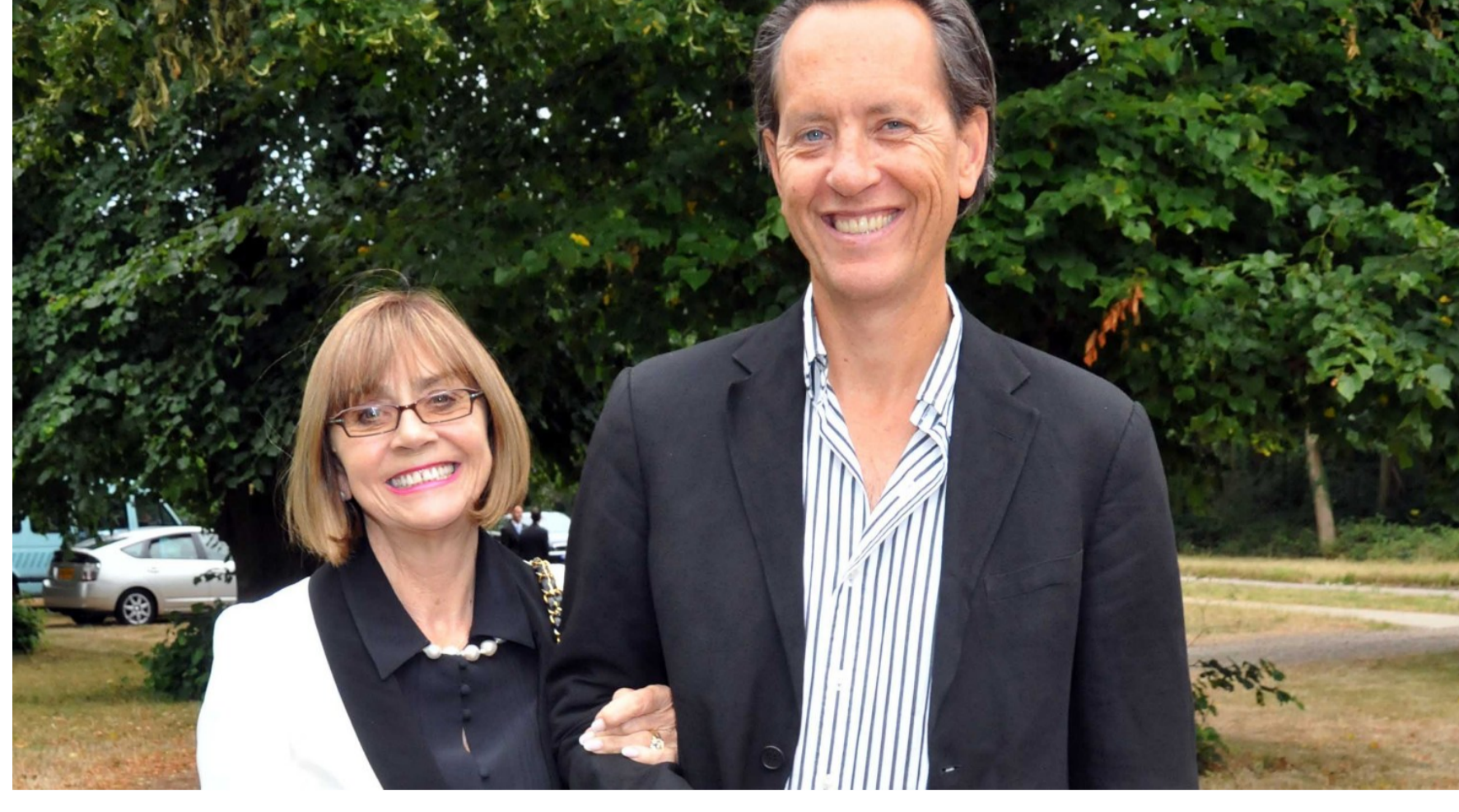
Richard E Grant owned the farmhouse with his wife Joan Washington for 33 years until her death in 2021